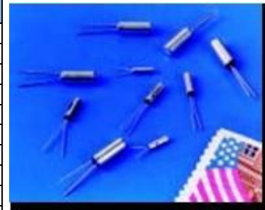
SCALE NONE DIMENSION IN mm/INCH

Notes: FREQUENCY DEVIATION AT T IS GIVEN AS: \Delta f/f = K (T_o - T)^2 , WHERE K IS PARABOLIC CURVATURE CONSTANT